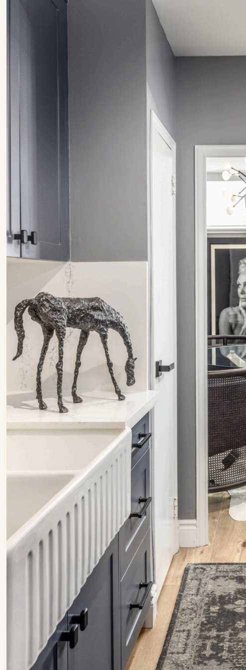
DESIGNER LIVING IN THIS FOREST HILL VILLAGE SUB-PENTHOUSE