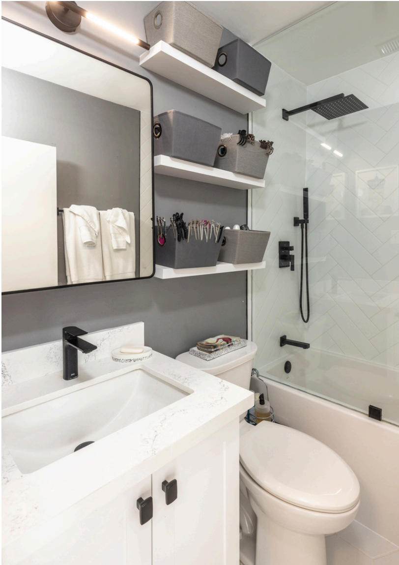
AIRY PRIMARY BEDROOM AND SPA-LIKE BATHROOM WITH SOAKER TUB